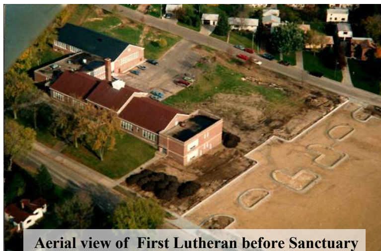
Aerial view of First Lutheran before Sanctuary

W abasha, Winona, Lanesboro, Harmony full itinerary posted on our bulletin board. open to all: not just First Lutheran folks.