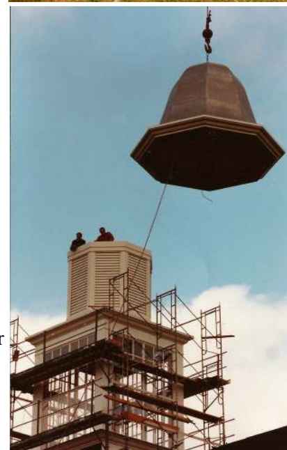
See aerial view of First Lutheran, pg. 9