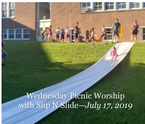
Wednesday Picnic Worship with Slip N Slide—July 17, 2019