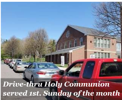
Drive-thru Holy Communion served 1st. Sunday of the month