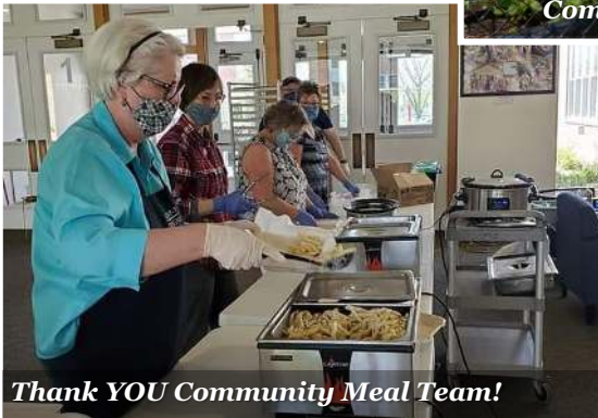
Thank YOU Community Meal Team!

First Lutheran Church of Columbia Heights is financed by the generous, direct monetary gifts of its members and friends.