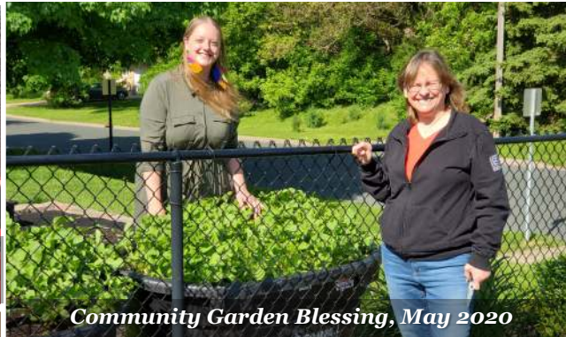
Community Garden Blessing, May 2020