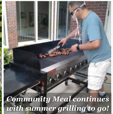
Community Meal continues with summer grilling to go!