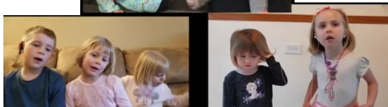
Screenshot of Sunday Children's Story