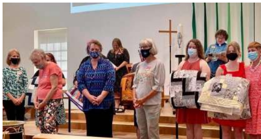
Graduation Sunday 2021. A blessing and Mission Workshop quilts for our H.S. grads.