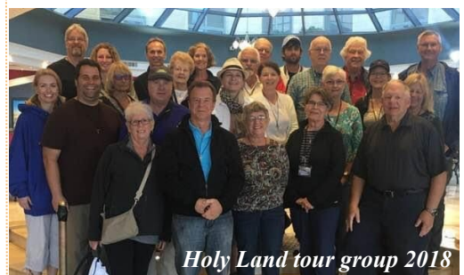
Holy Land tour group 2018