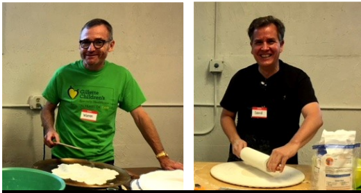
Fresh Lesfa served at the Holiday Market! 2017