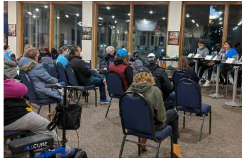
Thank you to everyone who came out for the powerful storytelling night on addiction and mental health in February.