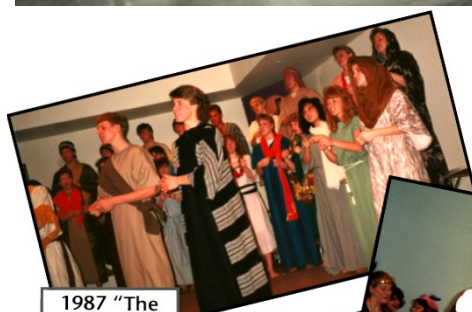
1987 "The Witness"