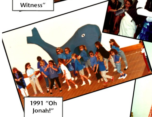
1991 "Oh Jonah!"