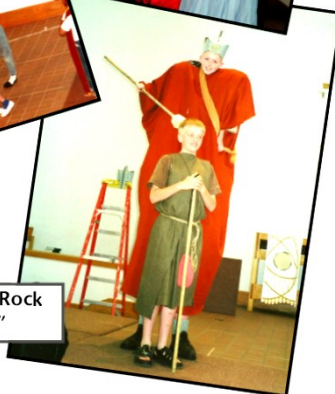
1999 "The Rock Slinger"