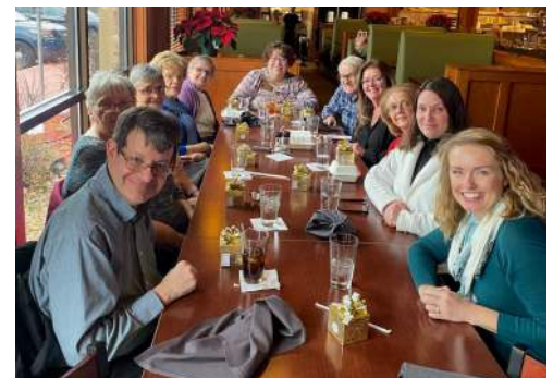
Some of our office volunteers gathered for a celebratory lunch. We appreciate the wonderful work you do!!