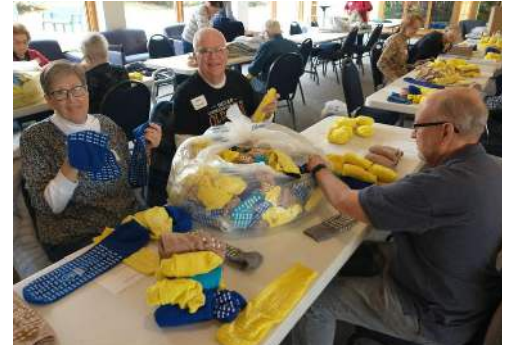
Young at Heart Group packing medical supplies for Global Health which will be shipped to hospitals in need around the world!