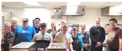
Youth Ministries Brunch