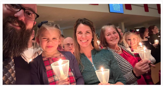
In Worship, Friendship & Prayer