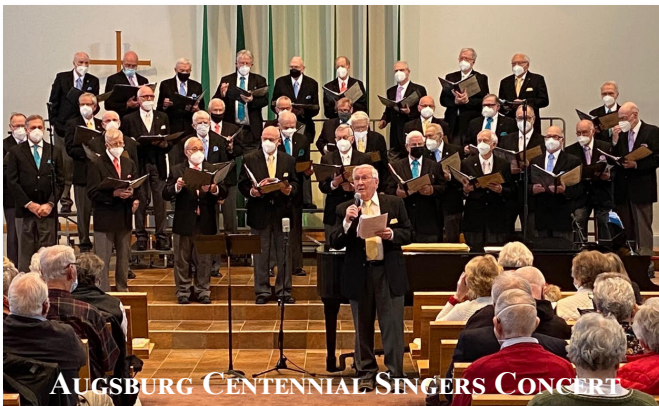
AUGSBURG CENTENNIAL SINGERS CONCERT