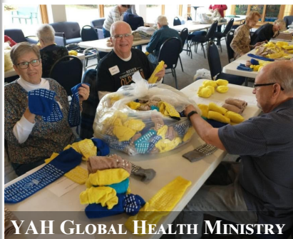
YAH GLOBAL HEALTH MINISTRY