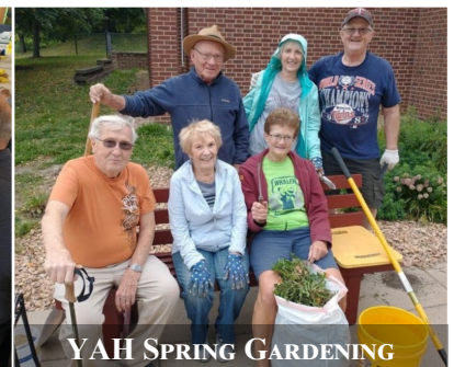
YAH SPRING GARDENING