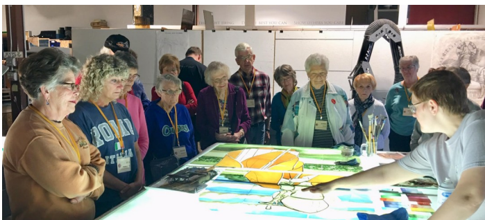
Young at Heart bus trip to Wabasha & Winona, MN Stained Glass Workshop Factory—2019