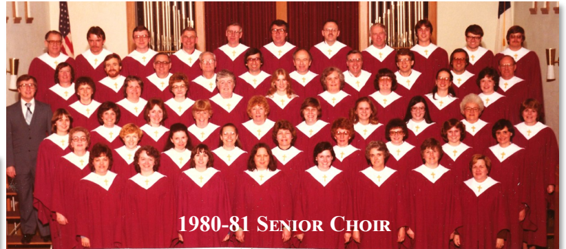
1980-81 SENIOR CHOIR