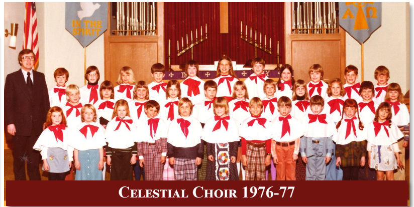
CELESTIAL CHOIR 1976-77

Singers and guests were masked due to Covid!