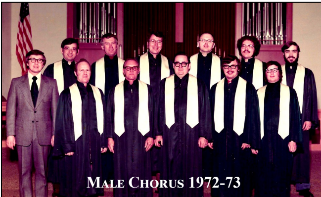
MALE CHORUS 1972-73