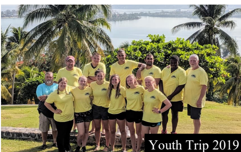
Youth Trip 2019

Kids, youth and families are invited to join us to clean-up our parks for Earth Day! First Lutheran has adopted Ostrander Park, across the street from church. We'll have a special treat of cupcakes to celebrate.