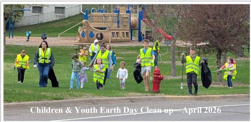
Children & Youth Earth Day Clean-up April 2026

A few projects on the calendar for this summer include repairing the Sanctuary doors, replacing the flooring in Katie Luther and the many routine repairs, painting and deep cleaning done throughout the building and grounds in preparation for the return of Bultum Academy's students and staff. (Check church bulletin for opportunities to help with projects or contact the church with your ideas!)